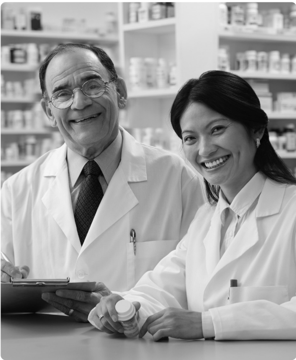
The Rx Choice network contains 57,000 pharmacies nationwide.

With the Rx Choice network, you can purchase your prescription medications from any of 57,000 in-network pharmacies located around the corner and across the country.